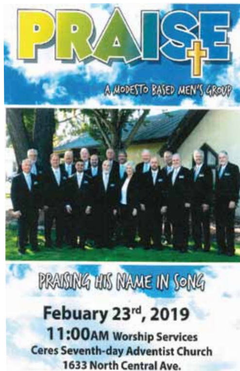
Praise Team Leaders: Pathfinder Club